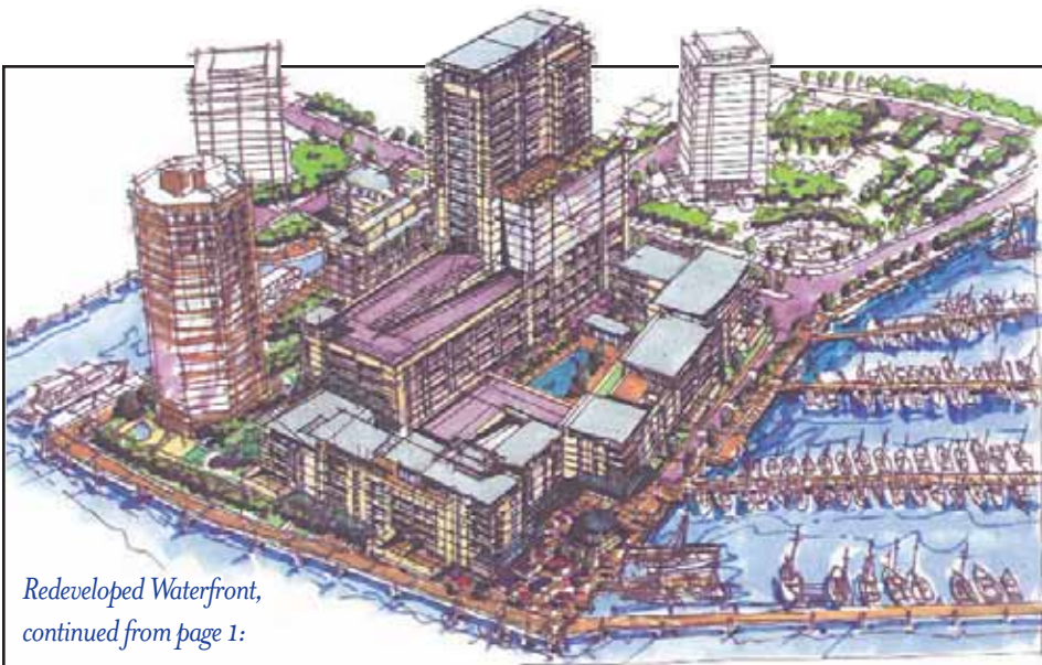
Redeveloped Waterfront, continued from page 1:

Portsmouth – 100 condominiums on the upper floors and 22,000 square feet of ground level retail. The final phase could include additional residential units. Two parking decks are also planned.