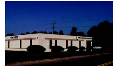
Shirley Construction Corp., 3535 Elmhurst Lane, Portsmouth

Shirley has completed or is currently working on several school projects in Hampton Roads and northeastern North Carolina. Last year, Shirley completed its largest project ever - a $12 million sports and wellness center at Christopher Newport University in Newport News.